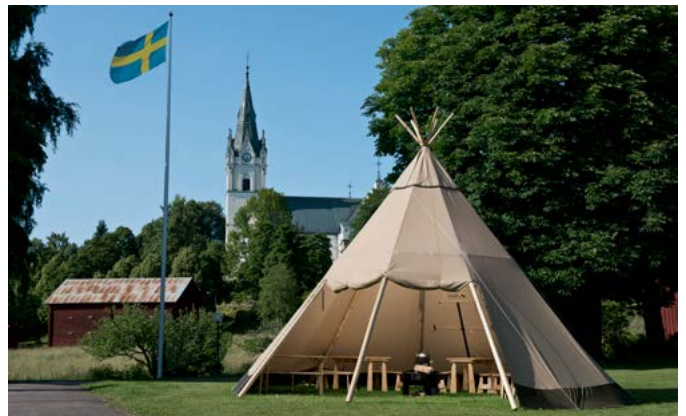
Cirrus 28 © Tentipi, Sweden - tentipi.com