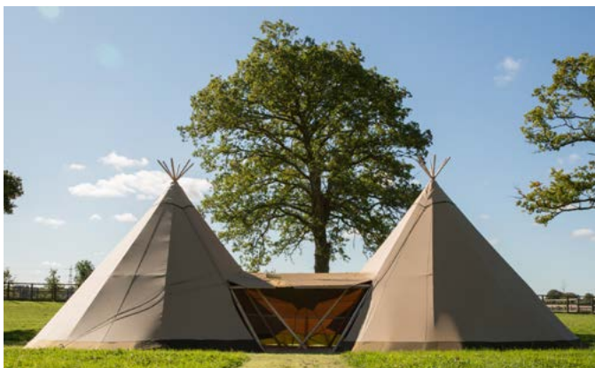
2 x Cirrus 40 + WallFlex © Tentipi, UK - tentipi.com