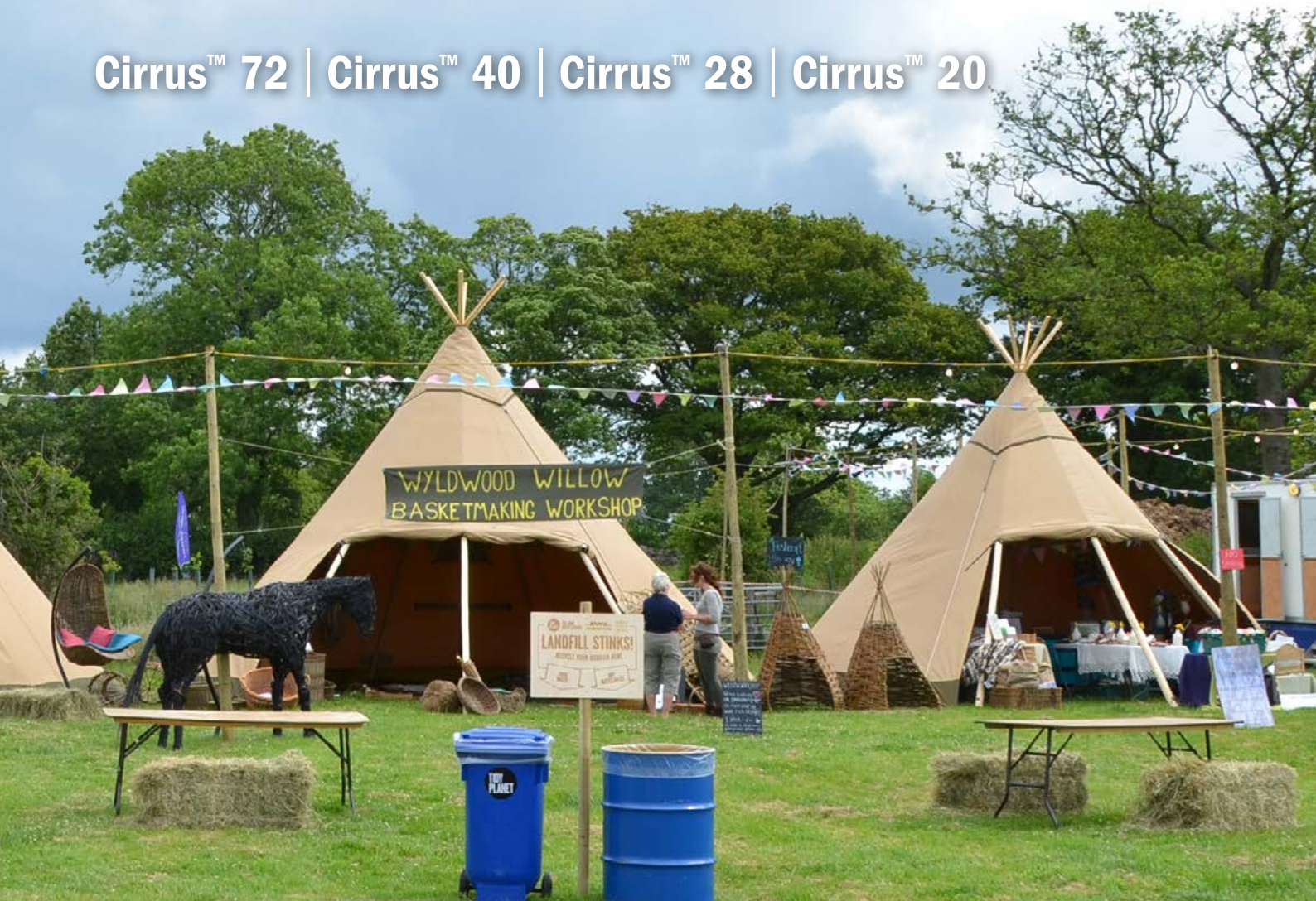
Cirrus 72, Cirrus 40, Cirrus 28 and Cirrus 20

We've designed Cirrus for those customers whose top priority is ease of use. To open the guest entrance, simply undo the two zips and roll up the canvas panel. There's a zippered door opposite the roll-up panel too.