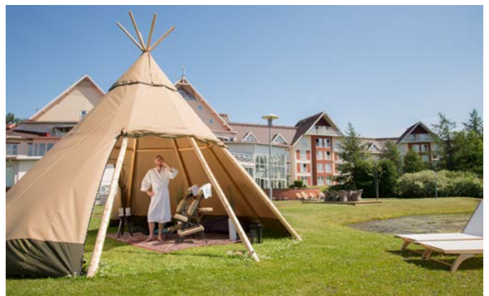
Cirrus 20