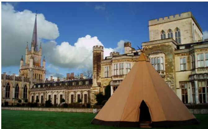
Cirrus 72