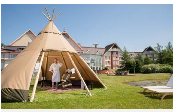
Cirrus 20 © Tentipi, Sweden – \underline{tentipi.com}