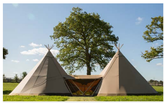
2 x Cirrus 40 + WallFlex © Tentipi, UK - \underline{\text{tentipi.com}}