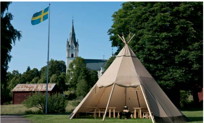
Cirrus 28