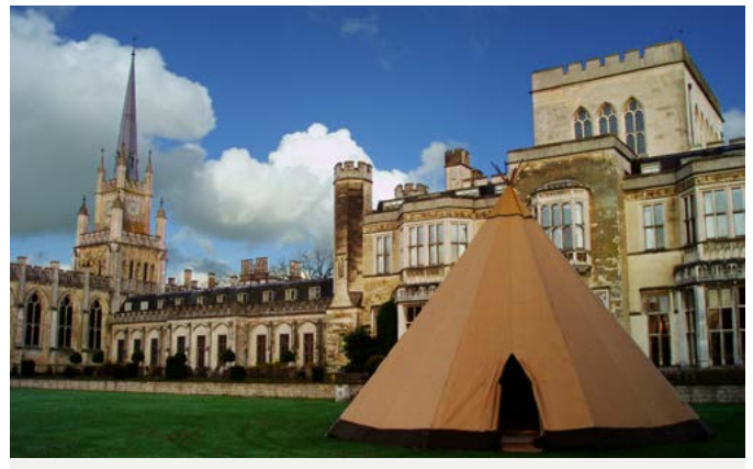
Cirrus 72 © Stunning Tents, UK - <u>stunningtents.co.uk</u>