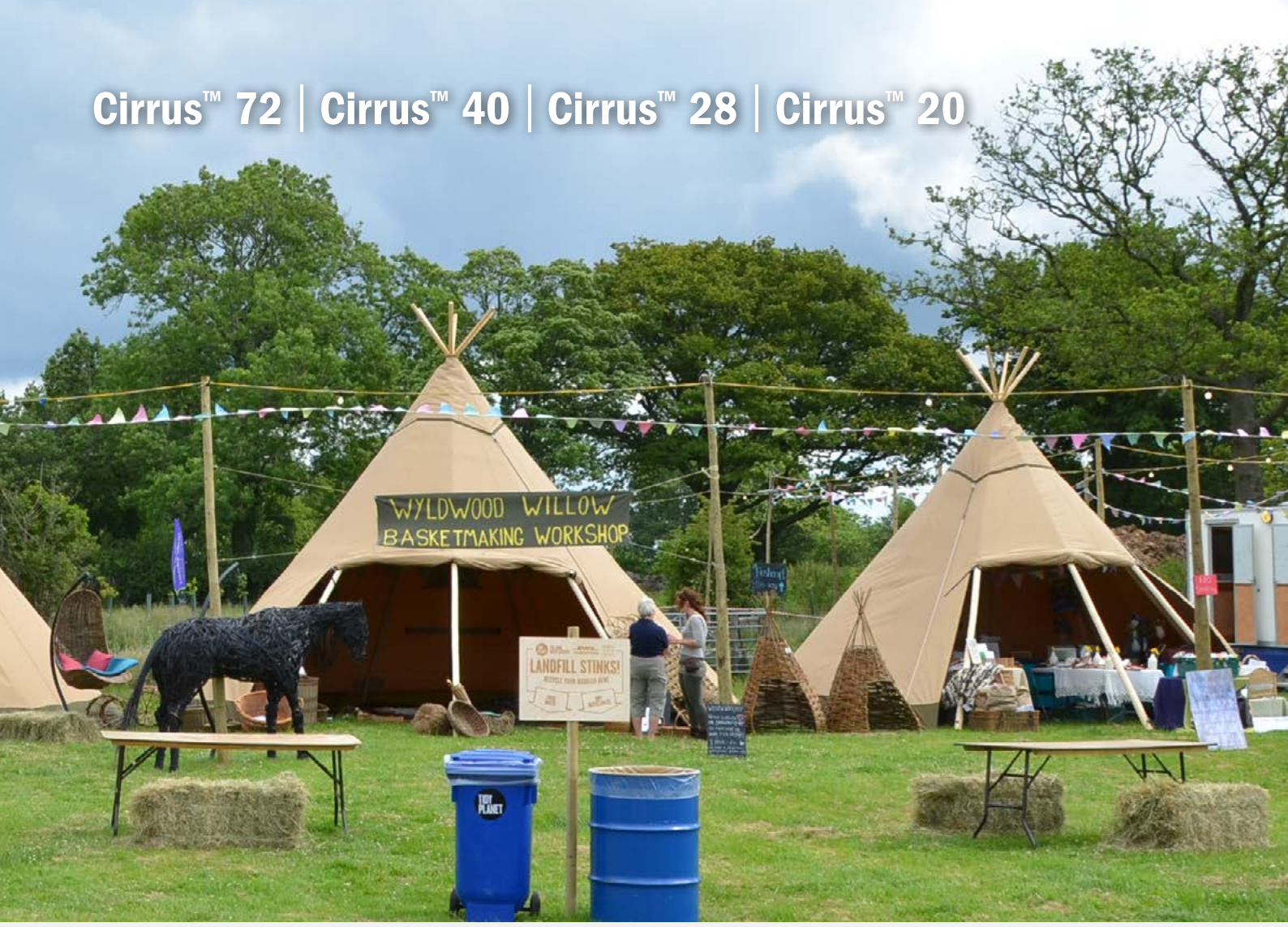
Cirrus 72, Cirrus 40, Cirrus 28 and Cirrus 20

We've designed Cirrus for those customers whose top priority is ease of use. To open the guest entrance, simply undo the two zips and roll up the canvas panel. There's a zippered door opposite the roll-up panel too.