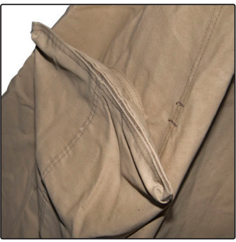
The chimney opening can be closed with the Velcro tape.