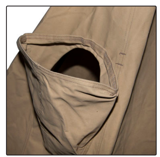
Opening for chimney.

NB! This product has been designed to be used with other Tentipi products. We take no responsibility for damage that can arise if the product is used in other ways.