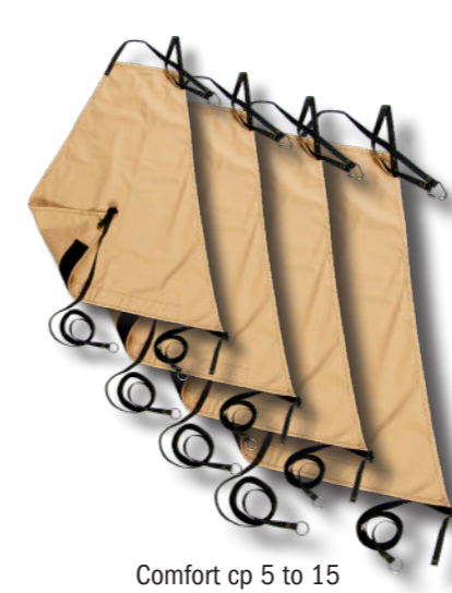
Comfort cp 5 to 15

The Accessory connector, formerly called the porch connector, is now available for all Nordic tipi sizes. Base light is available in size 7 and 9. Comfort light is available from size 2 to 9. Comfort cotton/polyester is available from size 5 to 15.