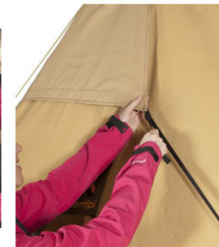
Tighten the bands, ensuring that the accessory connector is correctly and snugly positioned.