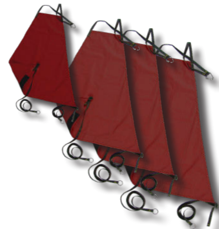
Comfort light 2 to 9