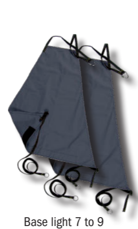
Base light 7 to 9