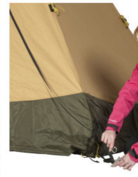
Peg the long bands to the ground.